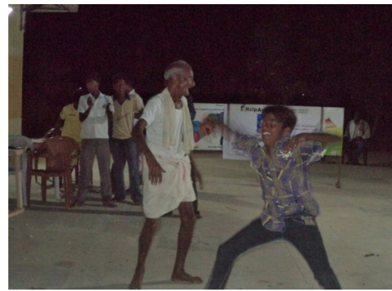
Group dance by the boys(Santhnoor) A folk dance by the Nanbarkal Nager. A dance with elders ( Santhanoor) A group dance by the boys of Nanbarkal Nager) A skit performed by the girls