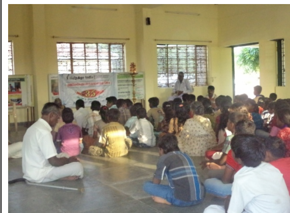
The morning hour starts with prayer The elders organize the prayer meeting. The children take the dependant elderly to their residents