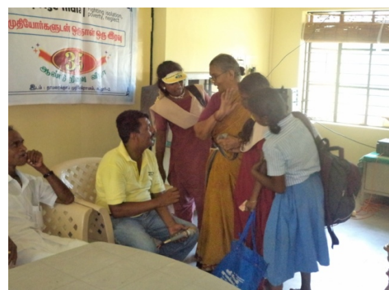
They select their children and take them home