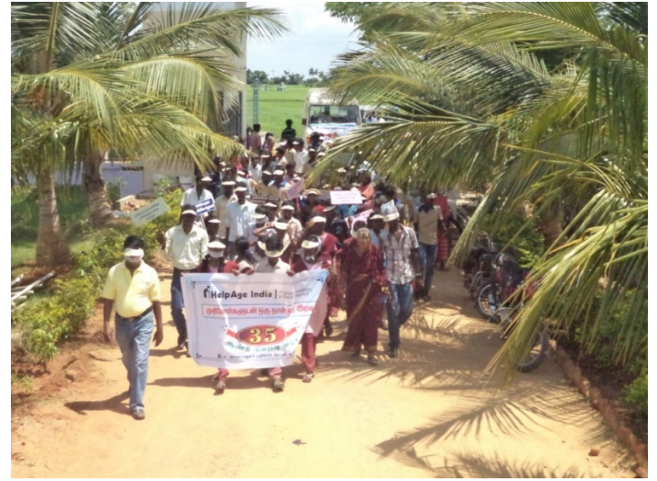
The residents welcome the children from the entrance by traditional way(Arathi) They bring the children