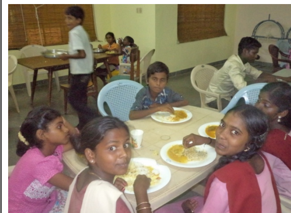
The delicious food is served , The children enjoy with BADA KANA. With residents