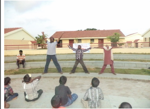
After the prayer the children enjoying yoga. The elders also participate with children