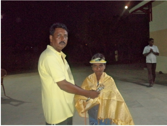
A honour for their dedicated service A honor for the organizer